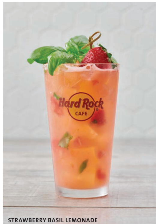
STRAWBERRY BASIL LEMONADE

All-natural vanilla bean ice cream blended with white chocolate and Oreo® cookies, finished with whipped cream and a sugar-dusted brownie square. US$10.00