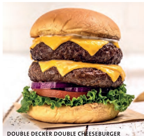
DOUBLE DECKER DOUBLE CHEESEBURGER

We hold allergy information for all menu items, please speak to your server for further details. If you suffer from a food allergy, please ensure that your server is aware at time of order. † Contains nuts or seeds. * These items contain (or may contain) raw or undercooked ingredients. Consuming raw or undercooked hamburgers, meats, poultry, seafood, shellfish or eggs may increase your risk of foodborne illness, especially if you have certain medical conditions.