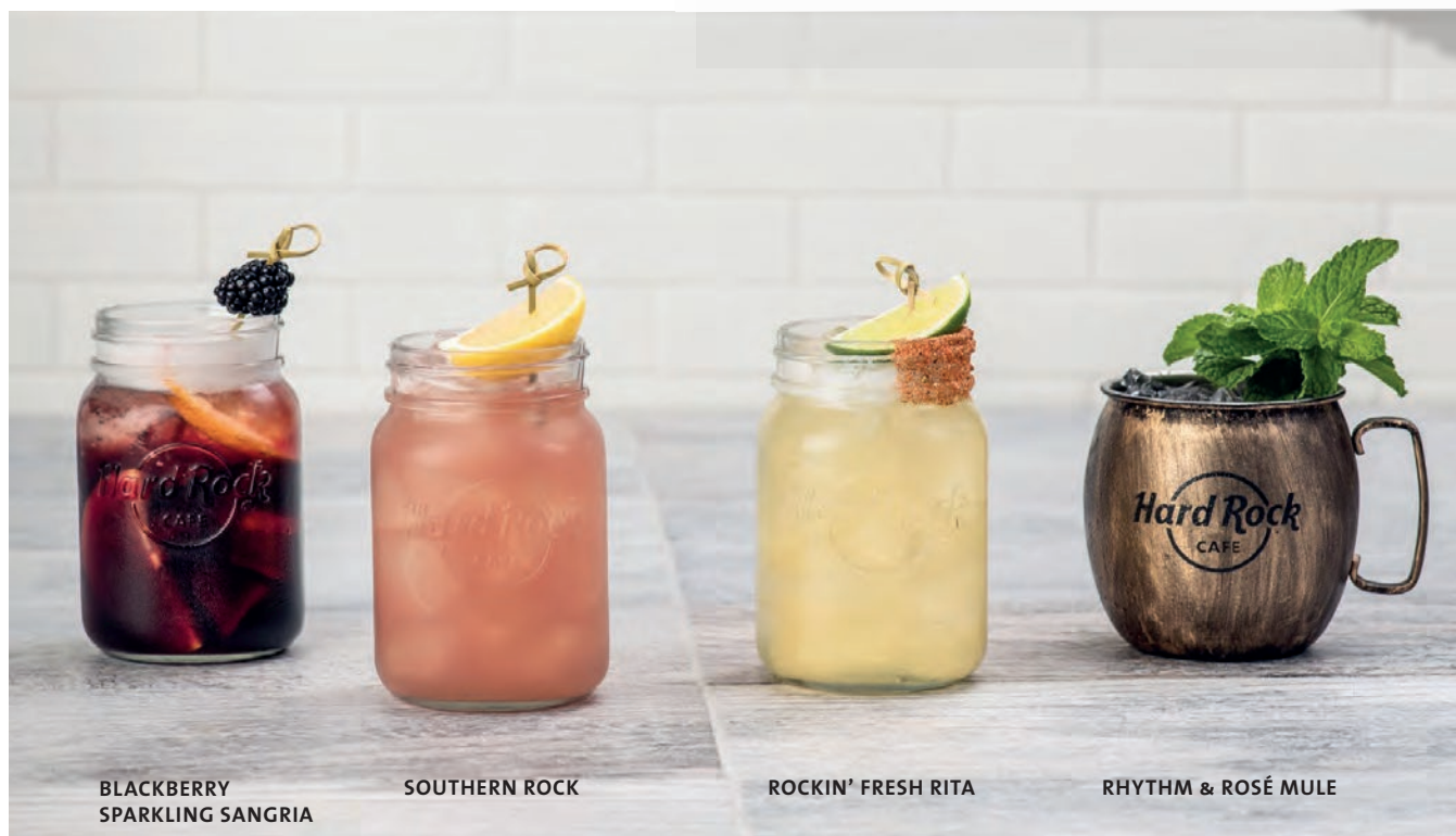
BLACKBERRY SPARKLING SANGRIA