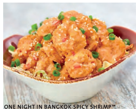
ONE NIGHT IN BANGKOK SPICY SHRIMP™

A creamy blend of romano and cheddar cheese, chopped spinach and artichoke hearts, served with crispy tortilla chips and house-made pico de gallo on the side. US$ 16