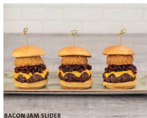
BACON JAM SLIDER

Three mini-burgers with melted American cheese, crispy onion ring and creamy coleslaw on a toasted brioche bun.* US$ 16