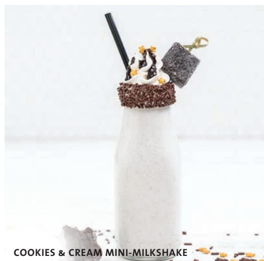
COOKIES & CREAM MINI-MILKSHAKE