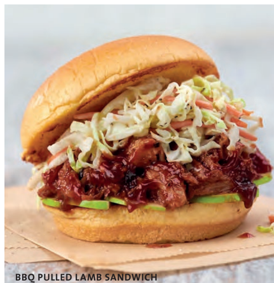
BBQ PULLED LAMB SANDWICH

227g grilled chicken breast, sliced and served with smoked turkey bacon, vine-ripened tomato, leaf lettuce and mayonnaise on toasted sourdough. US$ 18