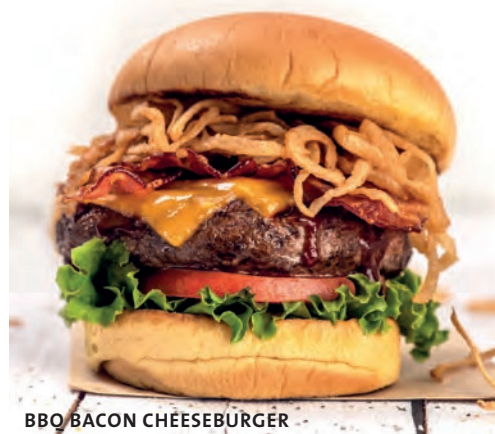
BBQ BACON CHEESEBURGER