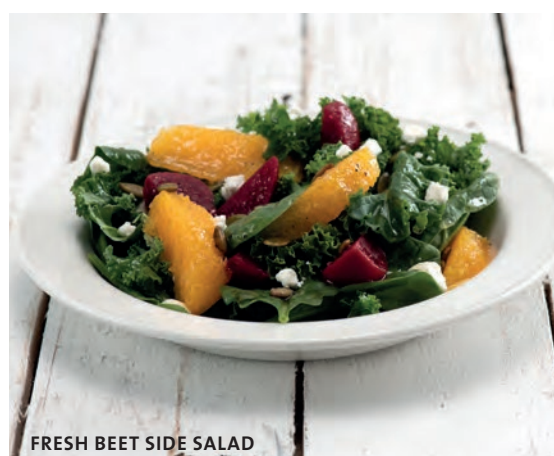
FRESH BEET SIDE SALAD