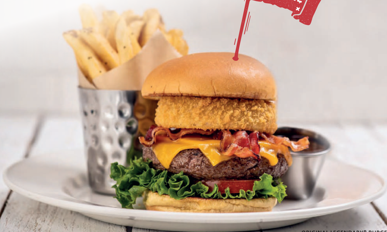
ORIGINAL LEGENDARY® BURGER