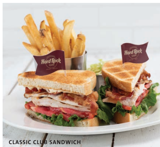
CLASSIC CLUB SANDWICH