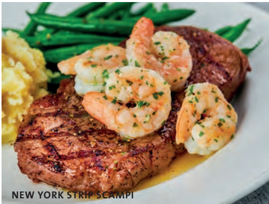
NEW YORK STRIP SCAMPI