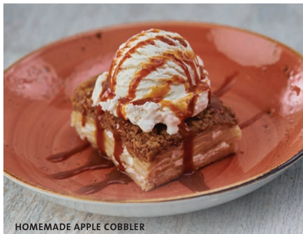
HOMEMADE APPLE COBBLER