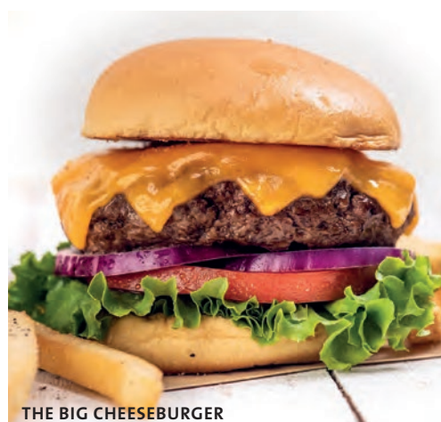
THE BIG CHEESEBURGER