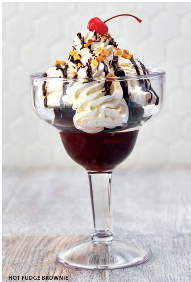
HOT FUDGE BROWNIE

All-natural vanilla bean ice cream blended with white chocolate and Oreo® cookies, finished with whipped cream and a sugar-dusted brownie square. US$10.00