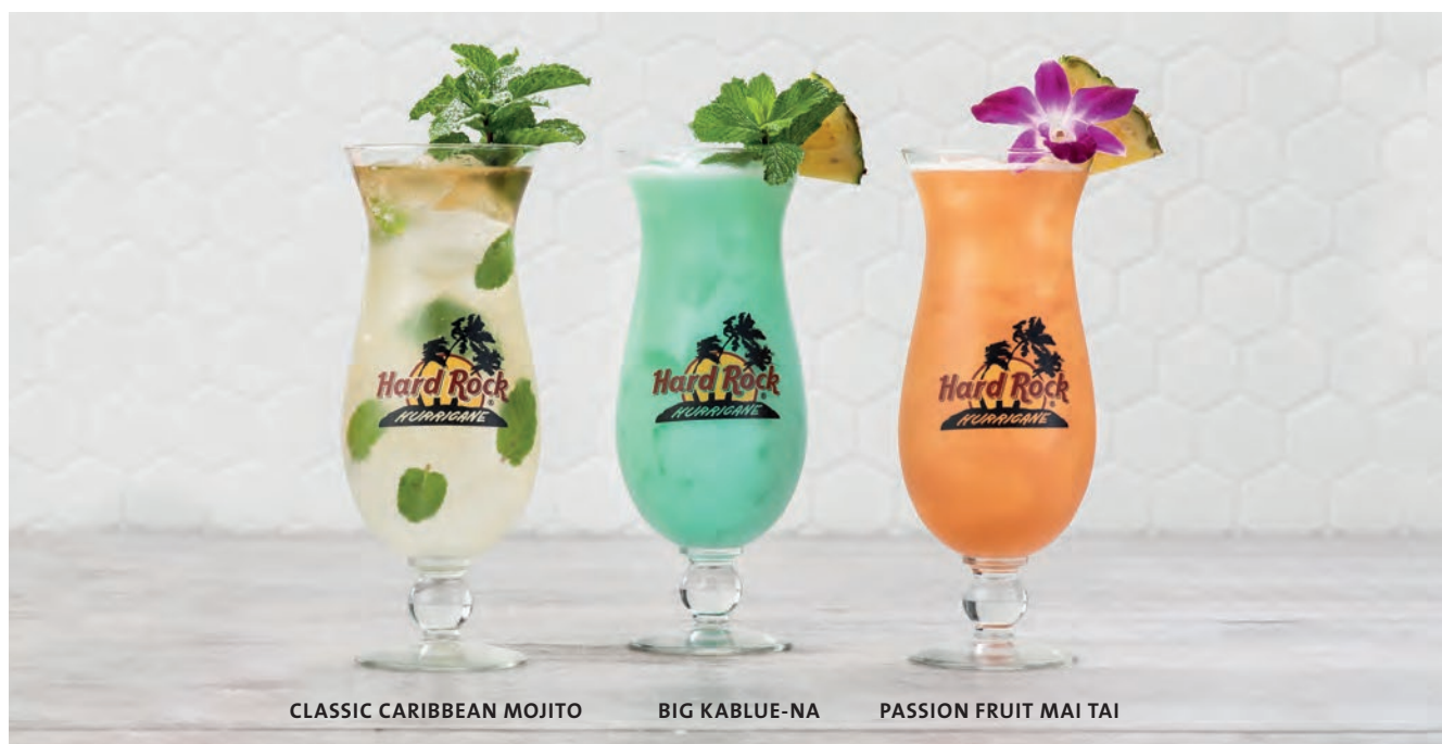
CLASSIC CARIBBEAN MOJITO